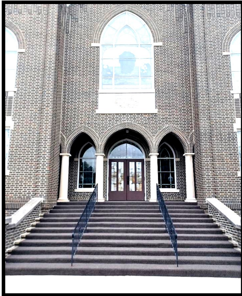
New Carpet Welcomes the Faithful to St. Matthew