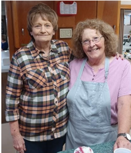
Service with a smile!