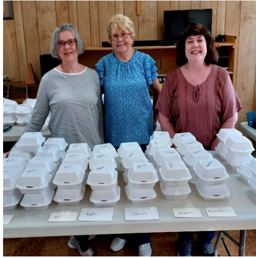
Carry-outs are ready!

A Great Meal was served and a Great Time was had by all!