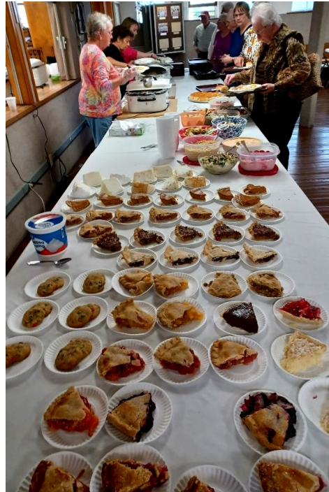
Lots of great salads and desserts!