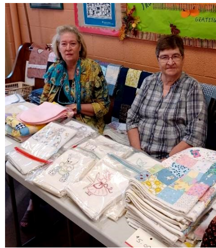
Lots of handmade items were available for purchase.