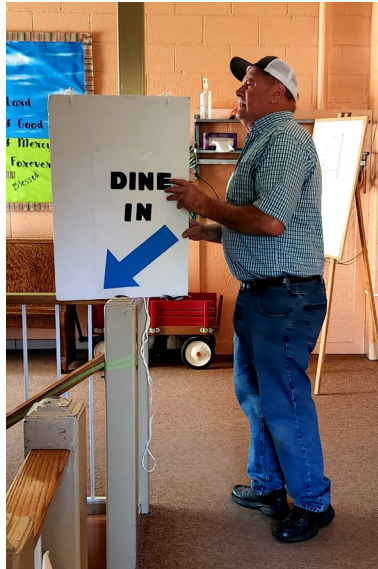
This Way for a Great Meal!