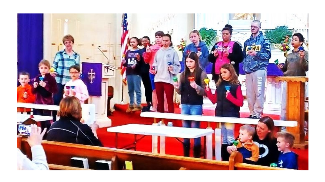
Lenten Soup Supper Was Fantastic!