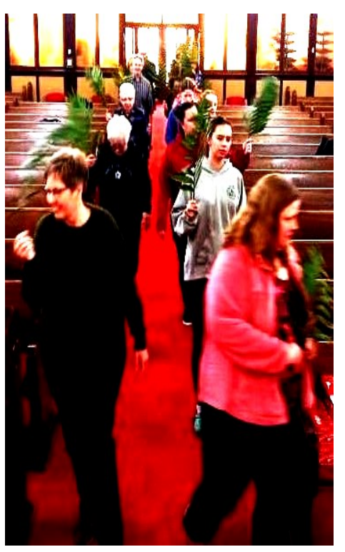
Palm Parade At St. Matthew Was Wonderful!