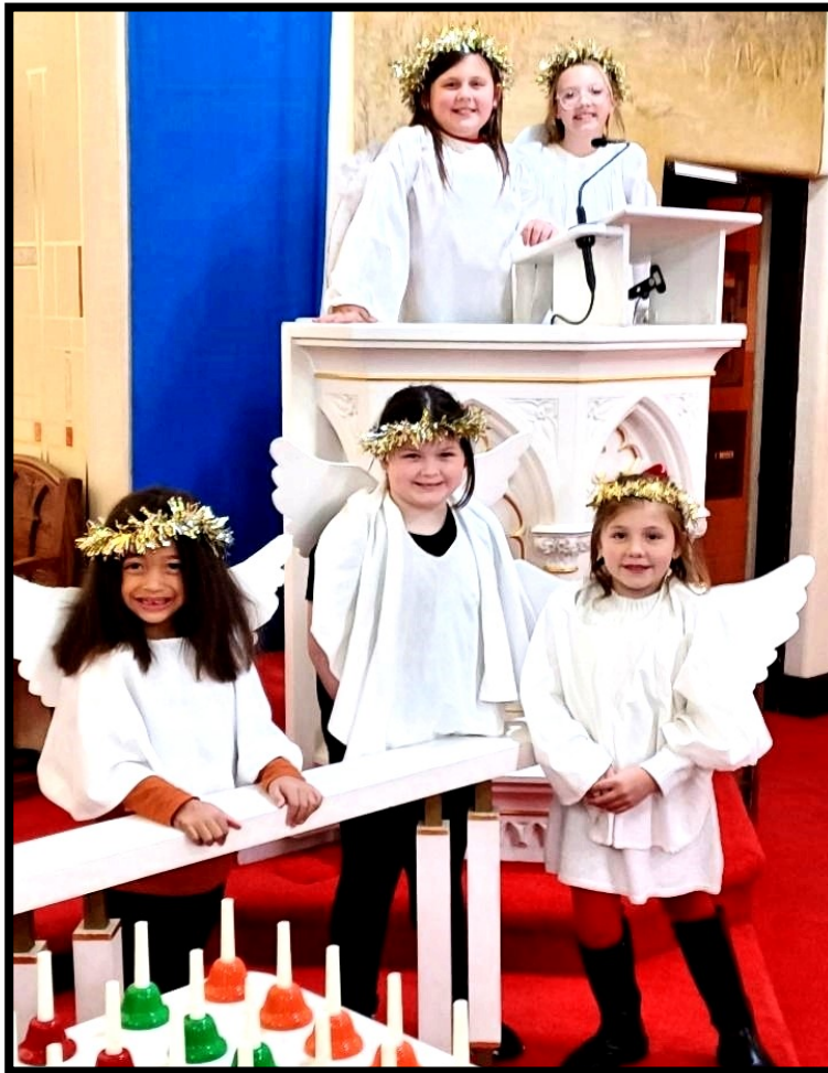
There Were Angels In The Church During The WOW Christmas Program!